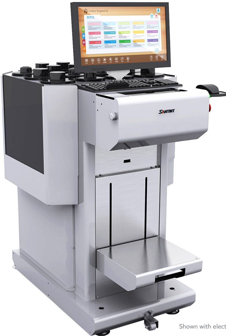
Shown with electric can table